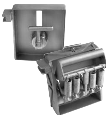
Standard and special claw with compression spring