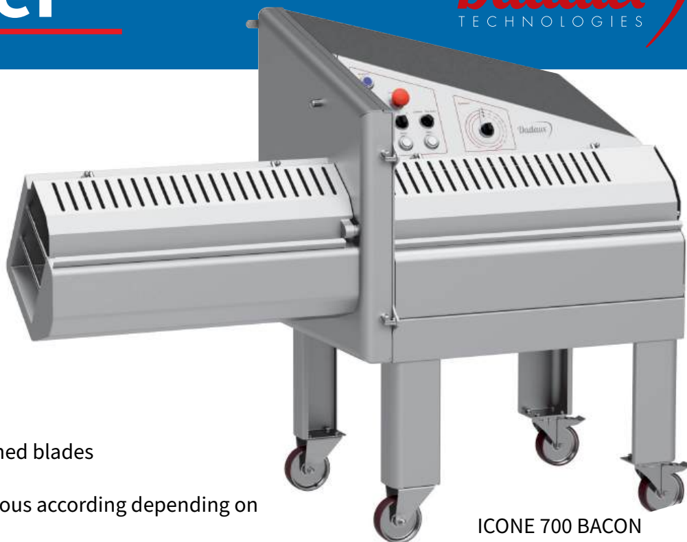
ICONE 700 BACON