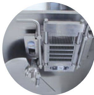
High quality cutting accessories