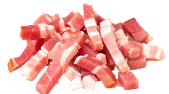
It allows to slice perfectly (meat, delicatessen, cheese, guts, vegetables)